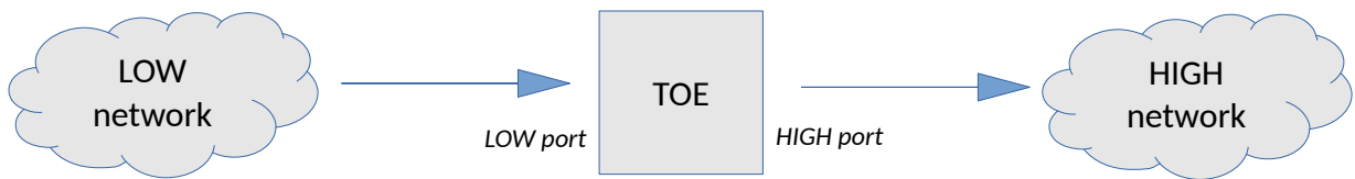
Figure 2: TOE placement and interfaces

The TOE implements the one-way data diode by repeating the signal emitted by the pitcher (part of the LOW network) to the catcher (part of the HIGH network). The optical fiber from the pitcher connects to the LOW port of the TOE. The optical fiber to the catcher connects to the HIGH port of the TOE. The only allowed information flow is therefore from the LOW to the HIGH side.